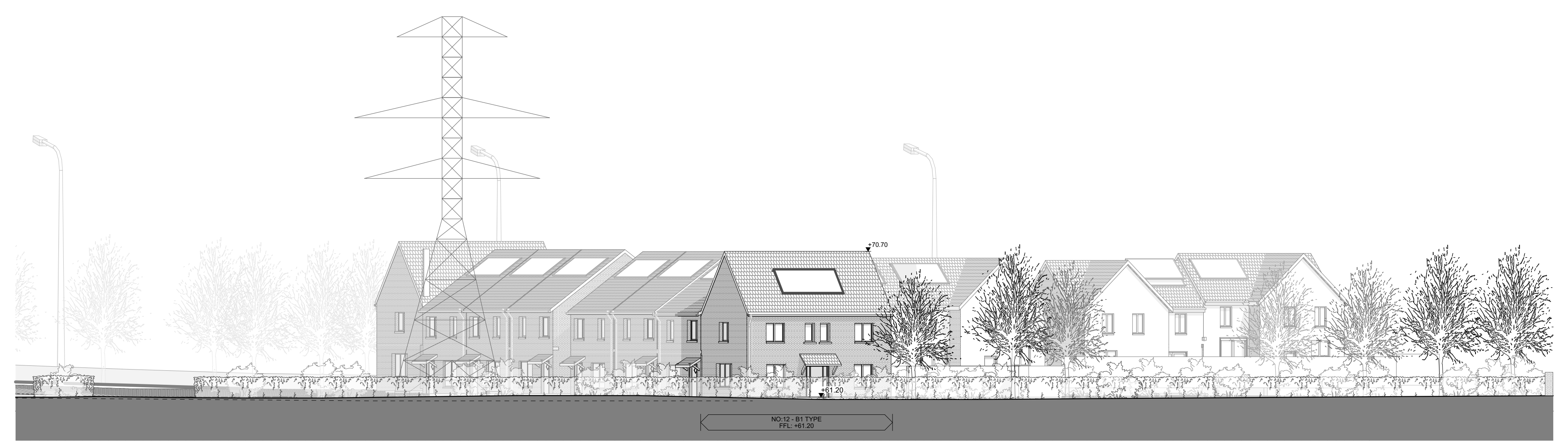
CC Site Elevation 1:200