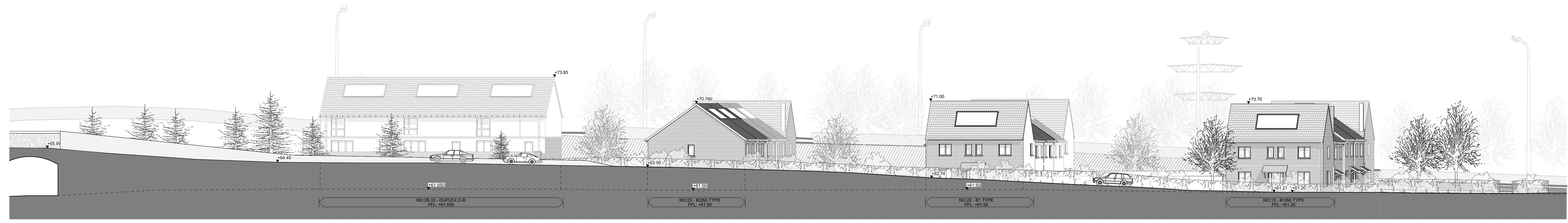
CC Site Elevation 1:200