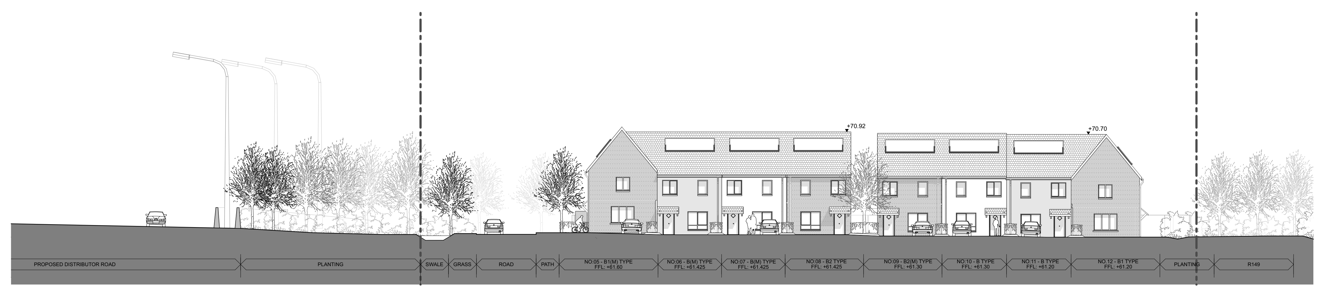
DD Site Section 1:200